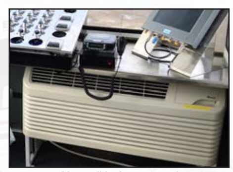
Air conditioning mounted underneath console