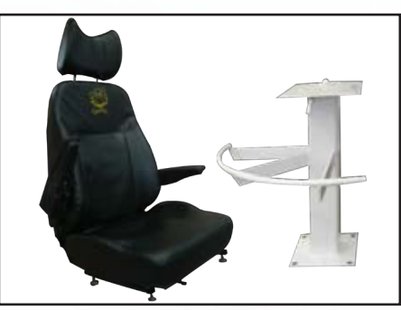
Captain's chair - adjustable on swivel base c/w arm and foot rests