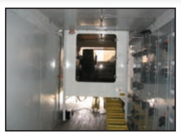
Tower in travel position (Inside of Van)