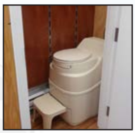
Self-contained Composting Toilet