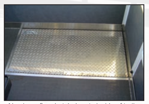
Aluminum floor hatch door to inside of trailer with gas cylinder assist opener