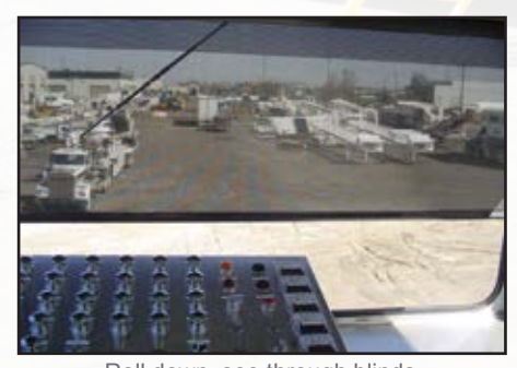
Roll down, see through blinds on front and 2 side windows