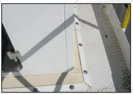
Rubber weather seal around tower