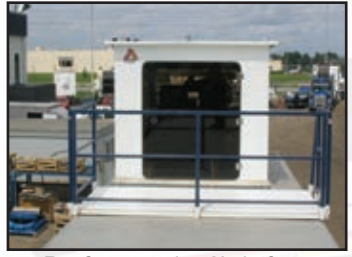
Roof mounted 4x8' platform with fold-down hand rails