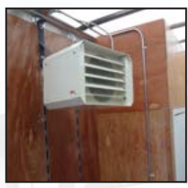
Electric Space Heaters