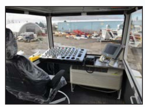
360° view of spread centralized control panel