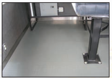
HD industrial rubber flooring w/ 6" stainless steel kick boards