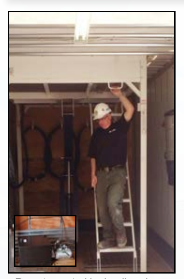
Remote control hydraulic scissor lift w/ 12V power pack and trailer to tower stairs