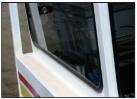
4° slopping bronze tinted windows