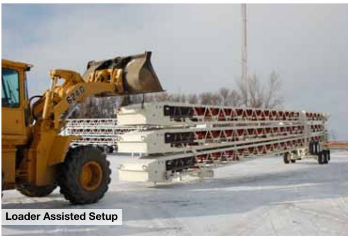
Loader Assisted Setup