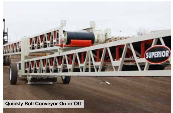
Quickly Roll Conveyor On or Off