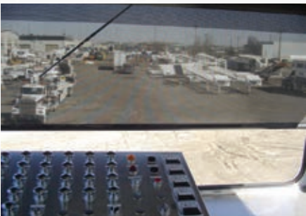
Roll down, see through blinds on front and 2 side windows