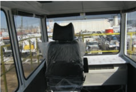
Lighting and shelving, stainless steel console, and captain's chair