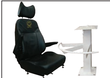
Captain's chair - adjustable on swivel base c/w arm and foot rests