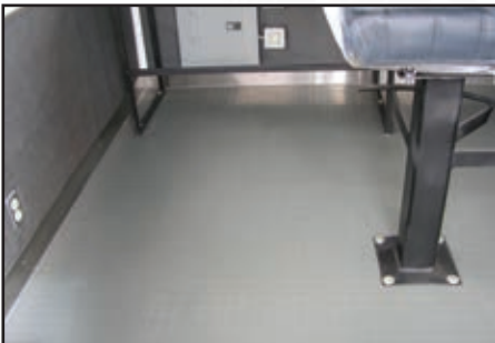
HD industrial rubber flooring w/ 6" stainless steel kick boards