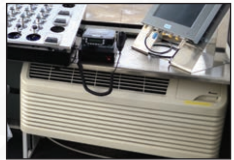
Air conditioning mounted underneath console