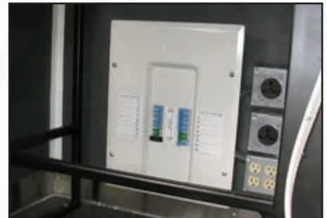
Electrical system: 16 circuit 70 Amp panel box c/w both 220 and 110 V outlets