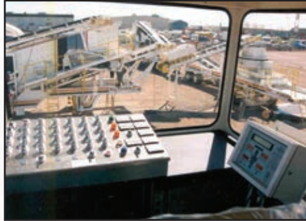
360° view of spread centralized control panel