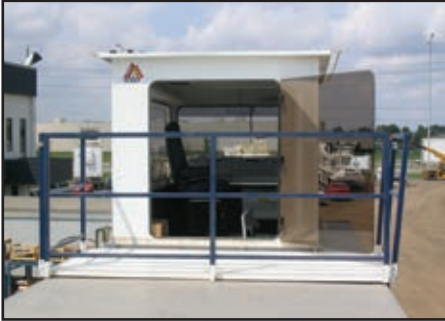
Oversized glass door for superior view of operations