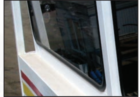
4° slopping bronze tinted windows