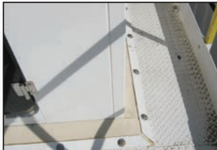
Rubber weather seal around tower