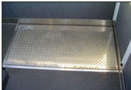
Aluminum floor hatch door to inside of trailer with gas cylinder assist opener