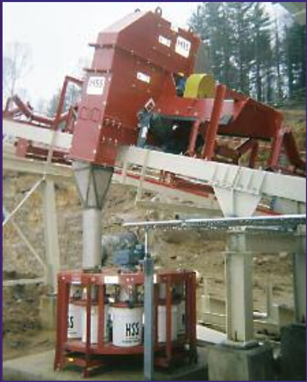
Sample Collectors Have From Two To Sixteen Collection Stations.