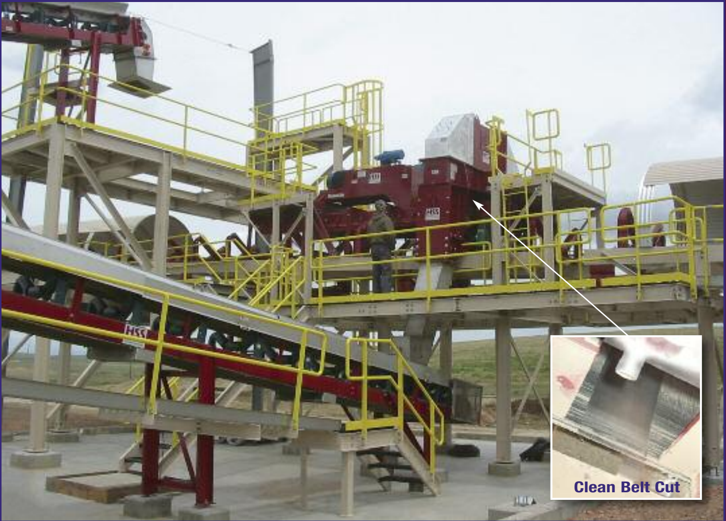
Clean Belt Cut